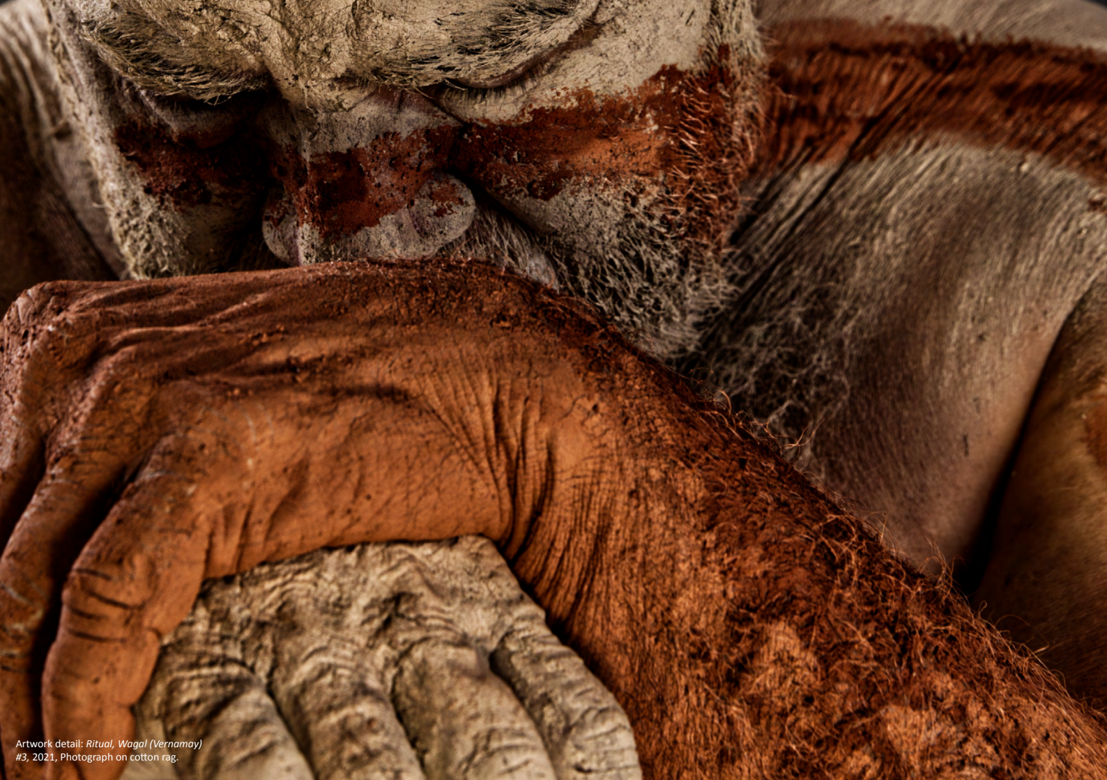
Artwork detail: Ritual, Wagai (Vernamay) #3, 2021, Photograph on cotton rag.