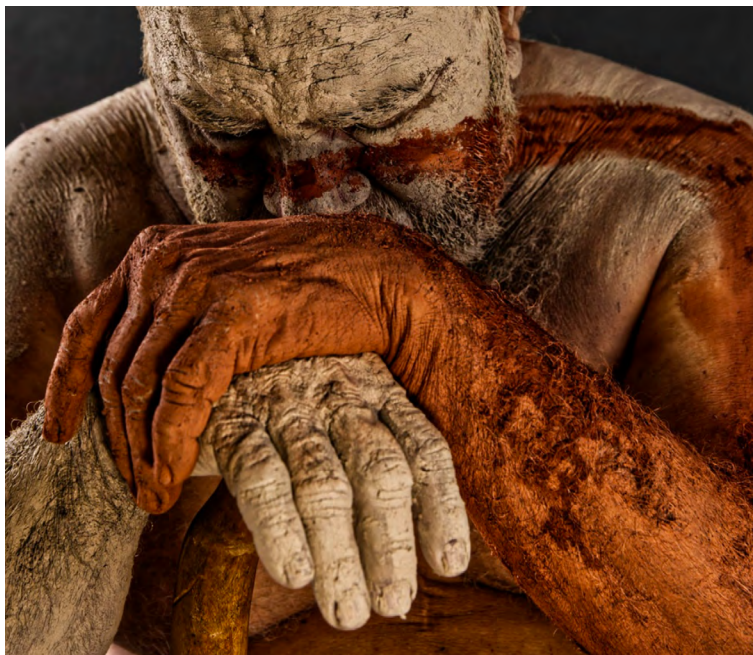
Ritual, Wagal (Vernamay) #3, 2021 Photograph on cotton rag