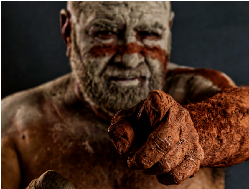
Ritual, Wagal (Vernamay) #5, 2021 Photograph on cotton rag