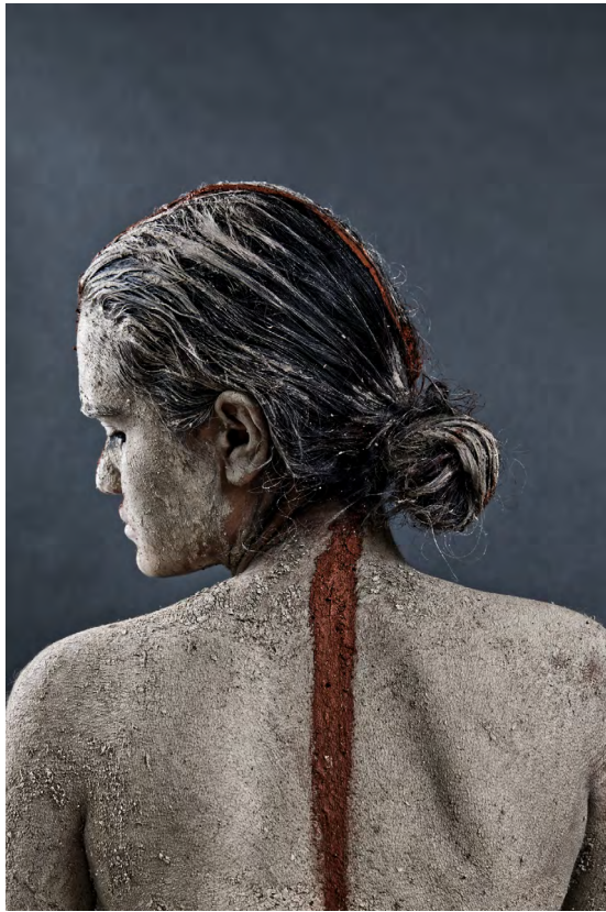
Ritual, Bawi (nan) #5, 2021 Photograph on cotton rag