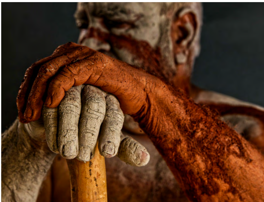
Ritual, Wagal (Vernamay) #1, 2021 Photograph on cotton rag