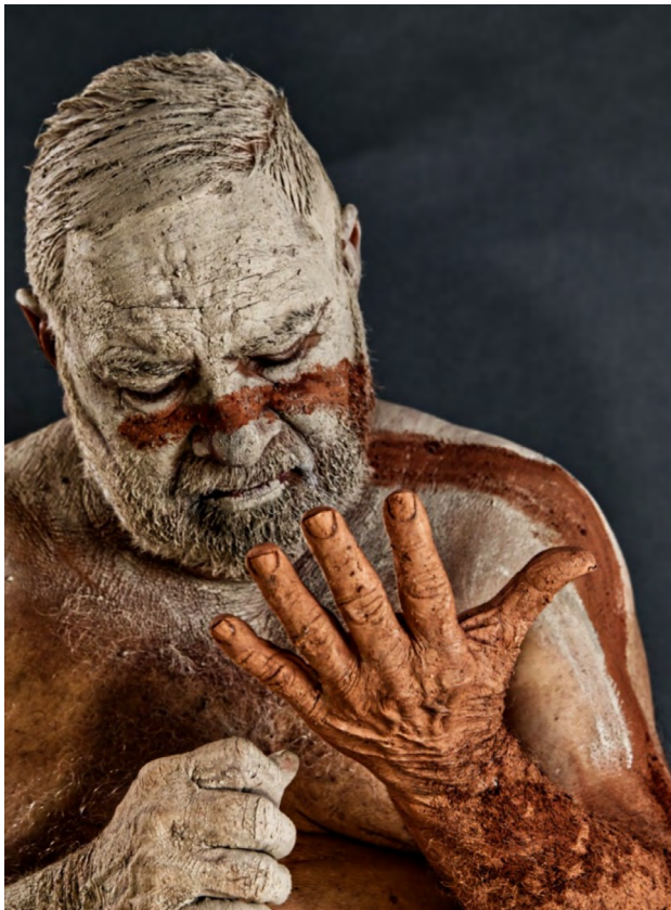
Ritual, Wagal (Vernamay) #4, 2021 Photograph on cotton rag