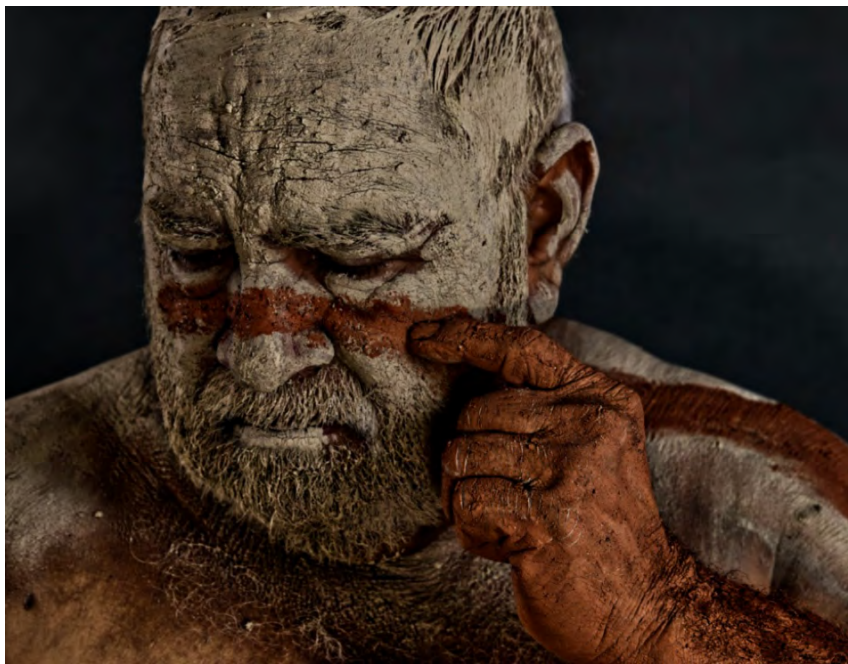
Ritual, Wagal (Vernamay) #2 , 2021 Photograph on cotton rag