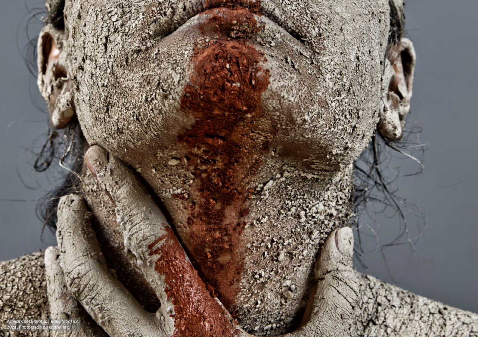
Artwork detail: Ritual, Bawi (nan) #3 , 2021, Photograph on cotton rag.