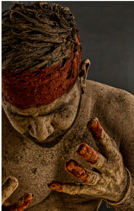
Ritual, Ngama (mum) #6, 2021 Photograph on cotton rag