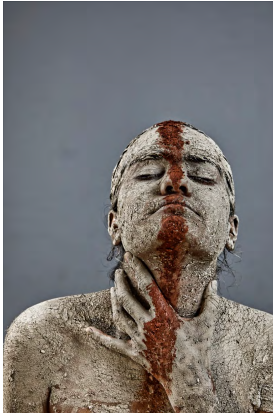
Ritual, Bawi (nan) #3, 2021 Photograph on cotton rag