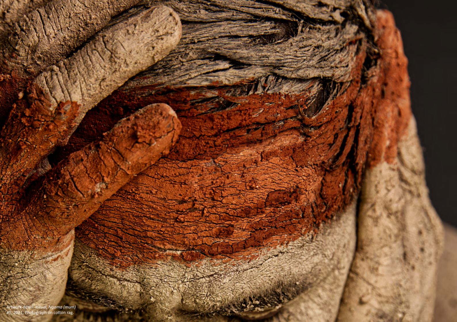
Artwork detail: Ritual, Ngama (mum) #5, 2021, Photograph on cotton rag.