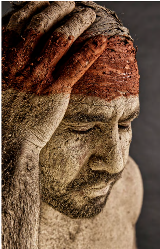
Ritual, Ngama (mum) #4 , 2021 Photograph on cotton rag