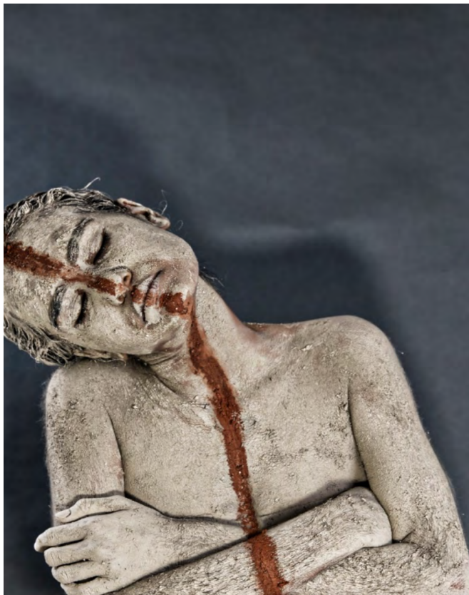
Ritual, Bawi (nan) #4, 2021 Photograph on cotton rag