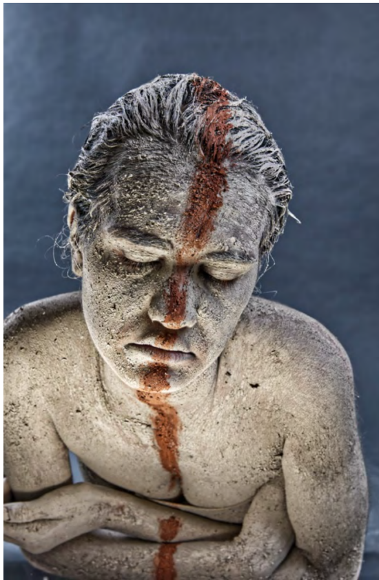
Ritual, Bawi (nan) #2, 2021 Photograph on cotton rag