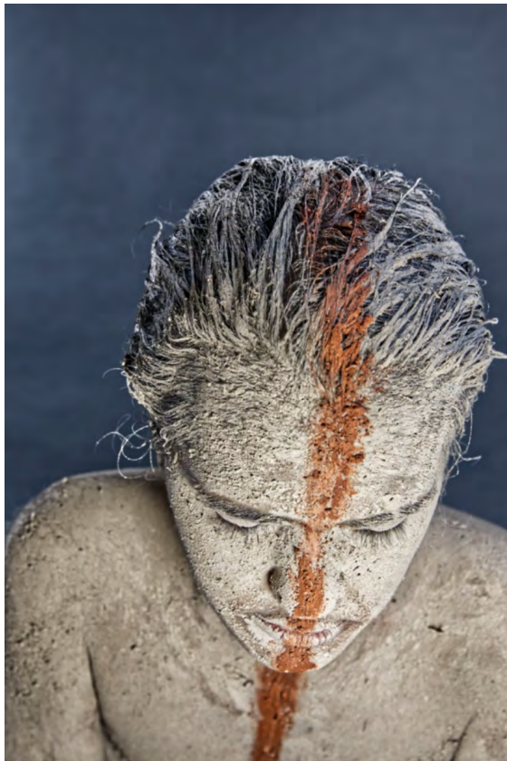
Ritual, Bawi (nan) #1, 2021 Photograph on cotton rag