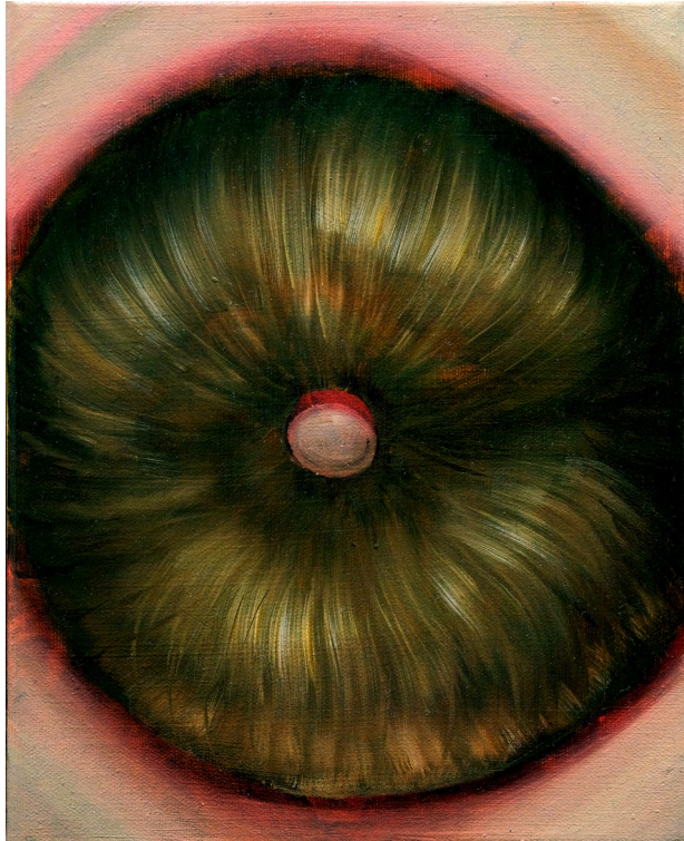
Nipple Ring, 2022 Oil on linen 30 x 24cm