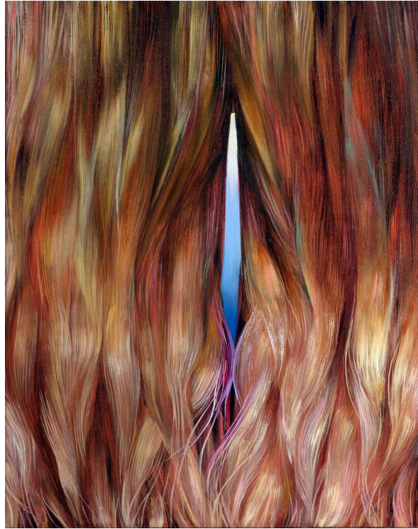
Skylight , 2022 Oil on canvas 50 x 40cm