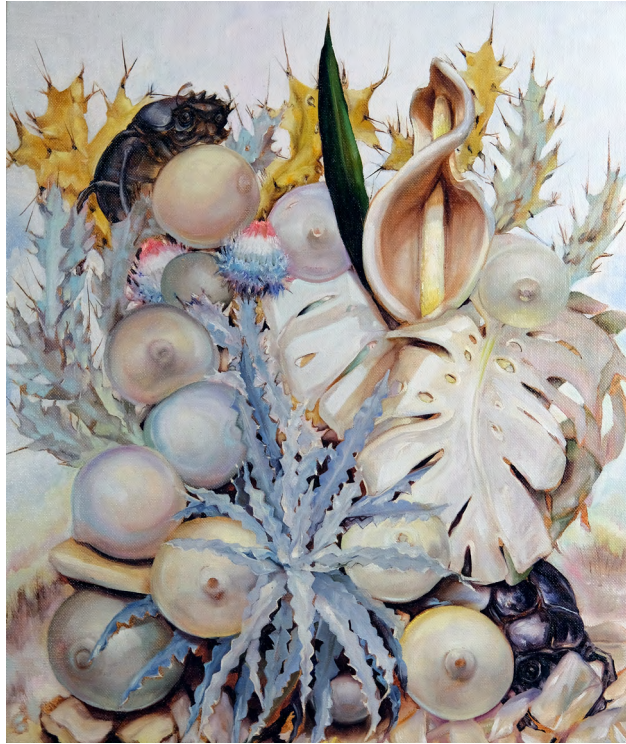
Bleached, 2022 Oil on linen 60 x 50cm