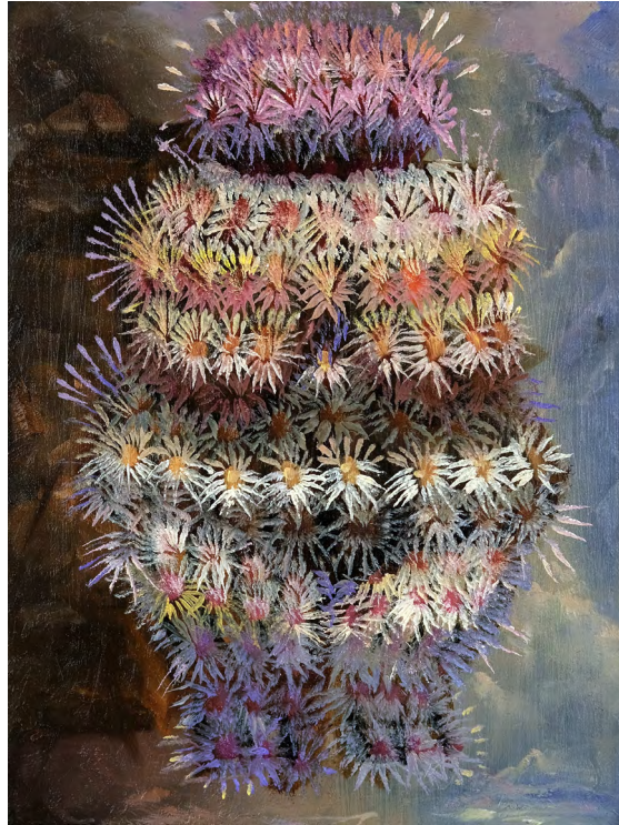
Venus idol , 2022 Oil on aluminum 28 x 21cm