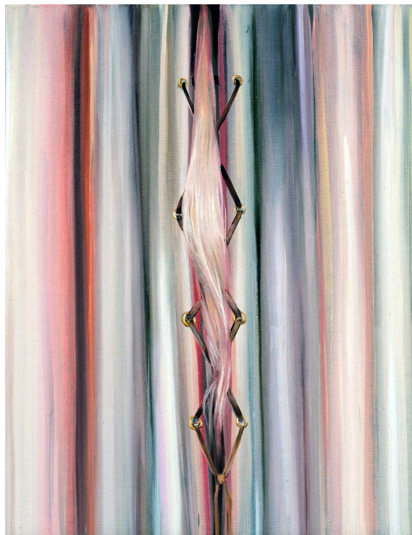
Lace up, 2022 Oil on canvas 39 x 30cm