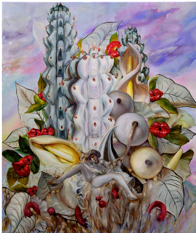
Swingers , 2022 Oil on canvas 89 x 74cm