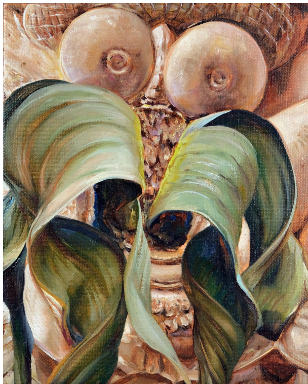
Flayed , 2022 Oil on linen 30 x 24cm