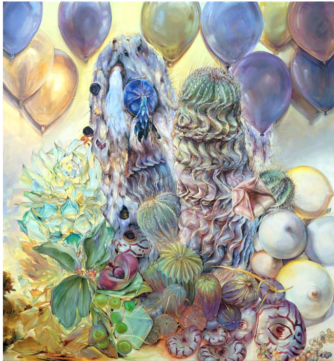
The Wedding Party, 2022