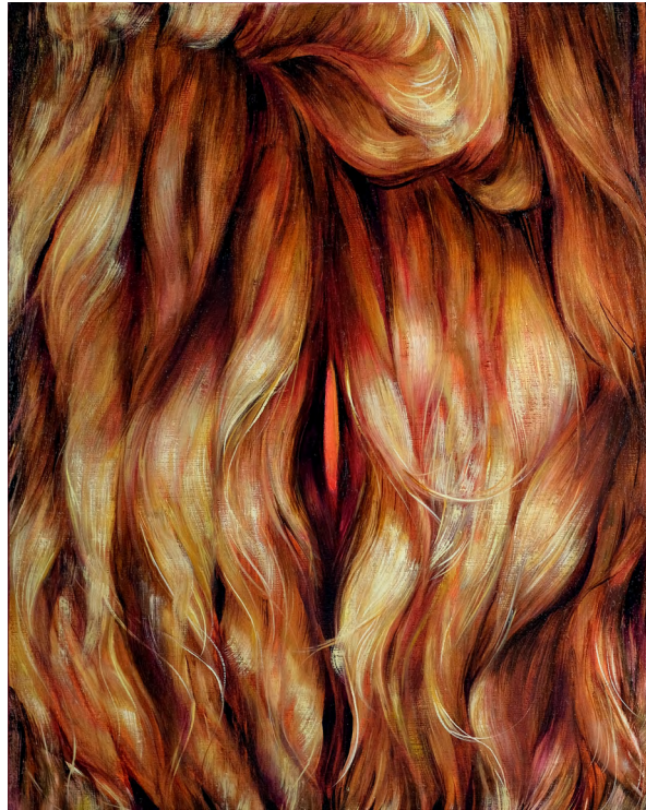
Red zone, 2022 Oil on linen 50 x 40cm