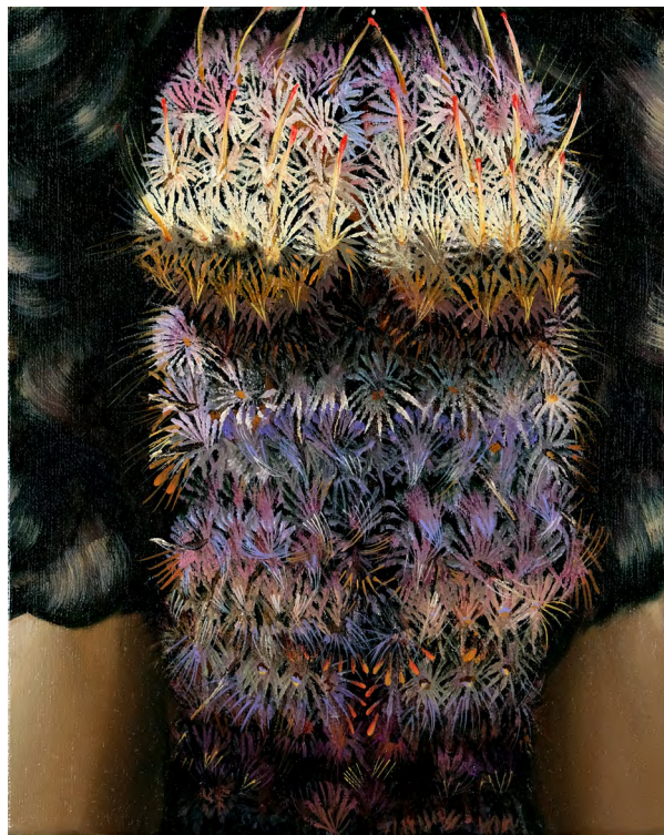
The rape (after Magritte), 2022