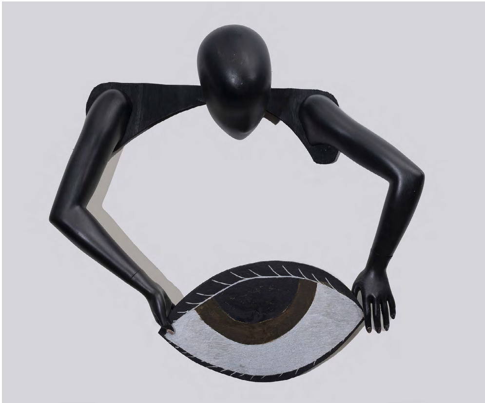
Intimate Dialogues #16, 2022 Acrylic, wood, found object 78 x 82 x 16 cm