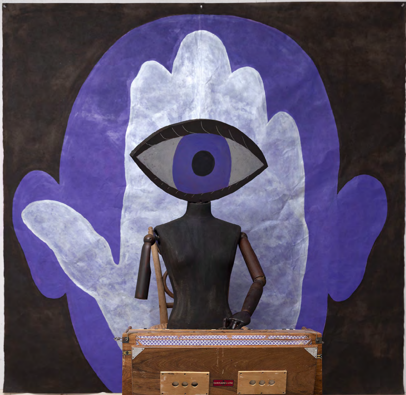
Intimate Dialogues #11 , 2022 Acrylic on Japanese paper 200 x 200 cm