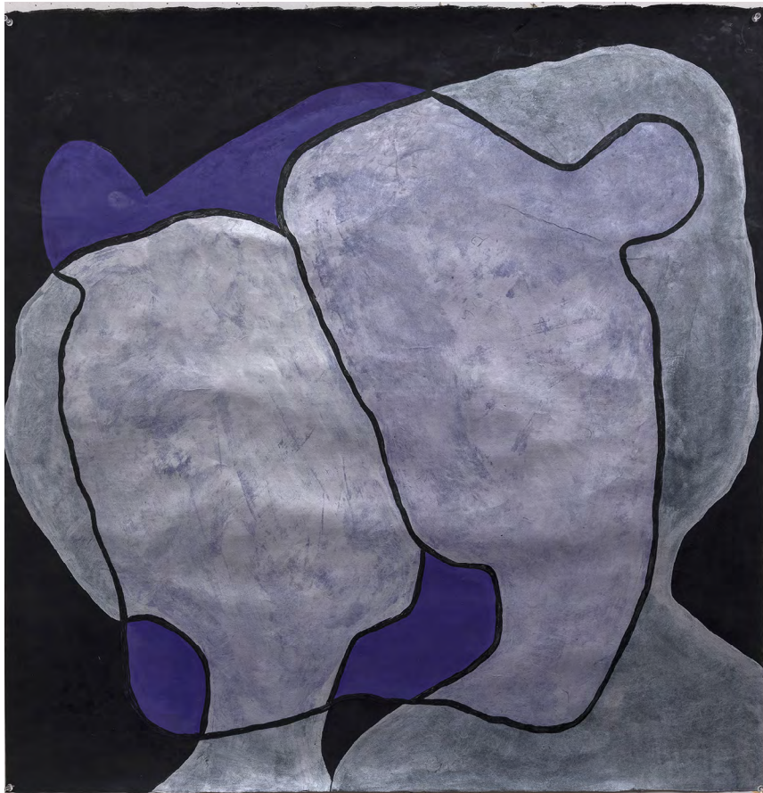
Intimate Dialogues #17, 2022 Acrylic on Japanese paper 100 x 100 cm