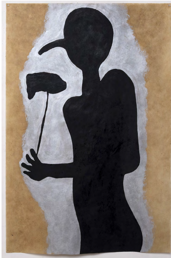
Intimate Dialogues #13, 2022 Acrylic on Japanese paper 150 x 100 cm