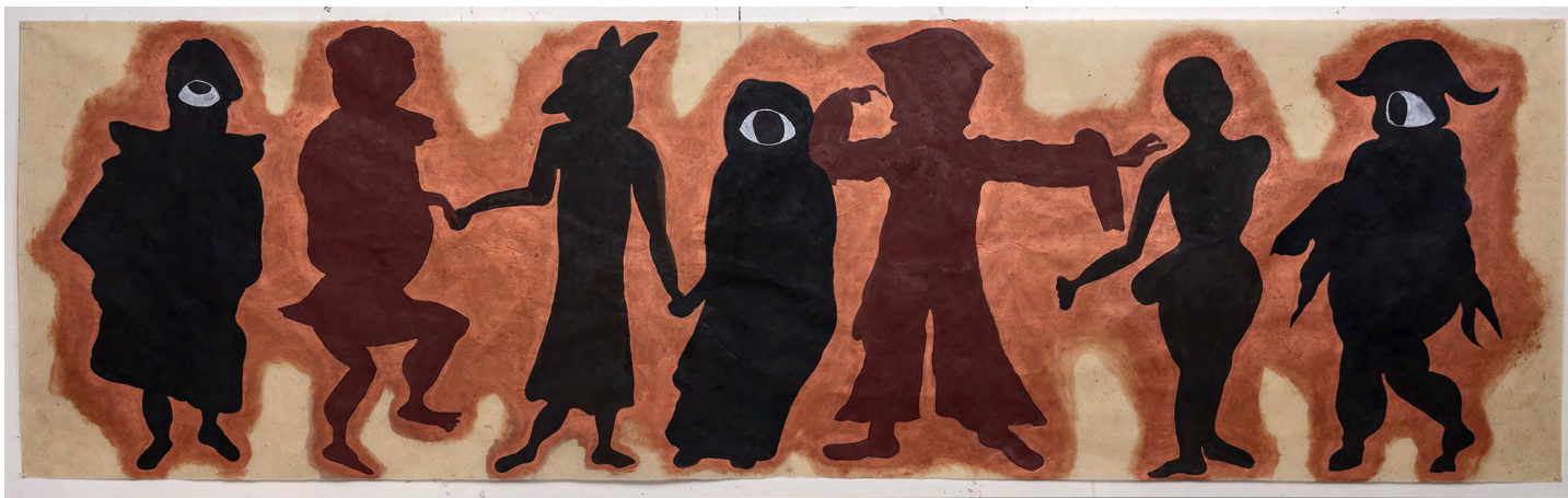
Intimate Dialogues #4 , 2022 Acrylic on Japanese paper 100 x 330 cm