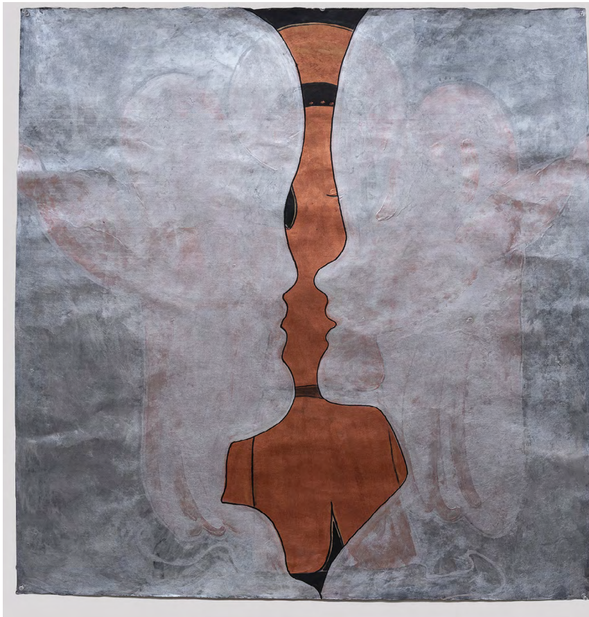
Intimate Dialogues #22, 2022 Acrylic on Japanese paper 100 x 100 cm