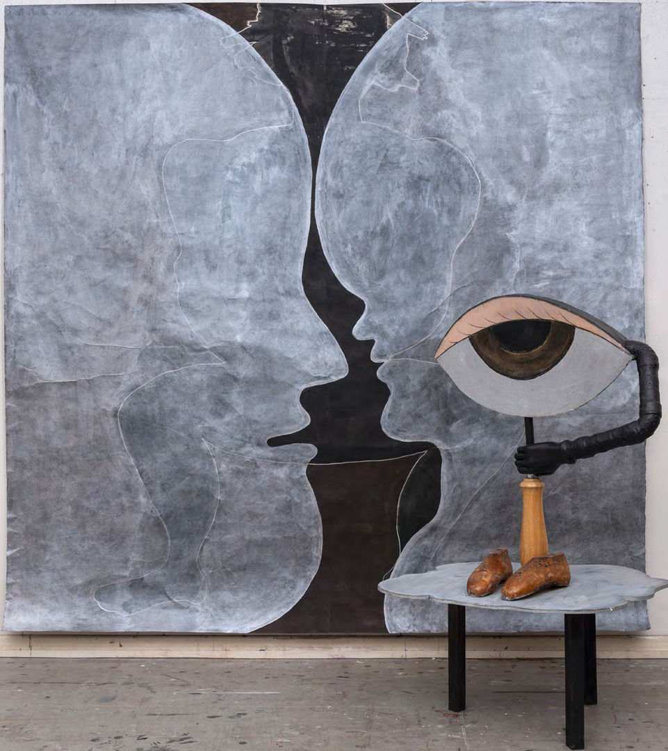
Intimate Dialogues #1, 2022 Acrylic on Japanese paper 200 x 200 cm