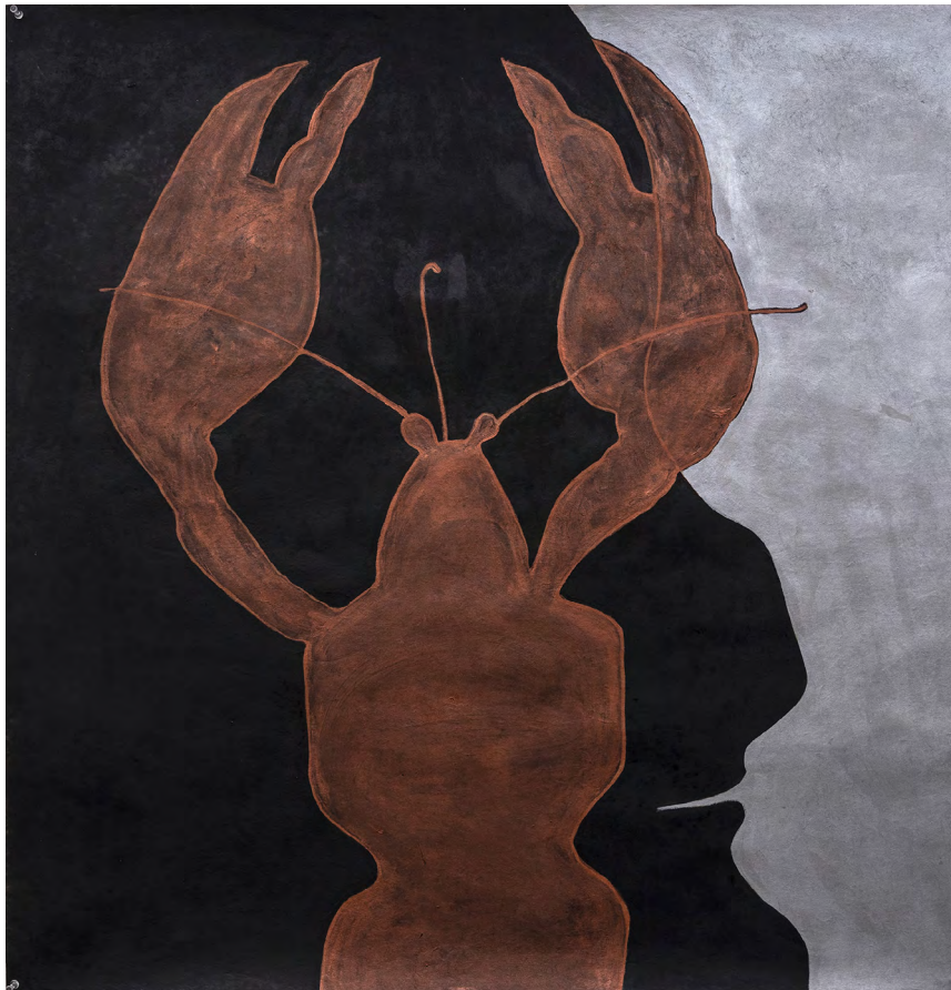
Intimate Dialogues #20, 2022 Acrylic on Japanese paper 100 x 100 cm