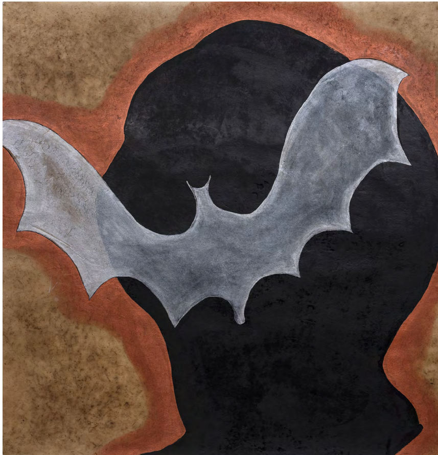
Intimate Dialogues #21, 2022 Acrylic on Japanese paper 100 x 100 cm