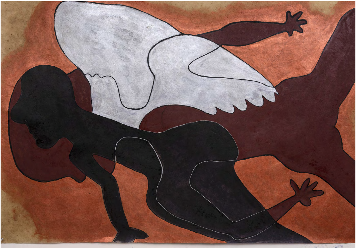
Intimate Dialogues #7, 2022 Acrylic on Japanese paper 100 x 150 cm