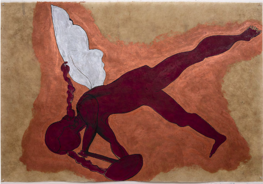
Intimate Dialogues #8, 2022 Acrylic on Japanese paper 100 x 150 cm