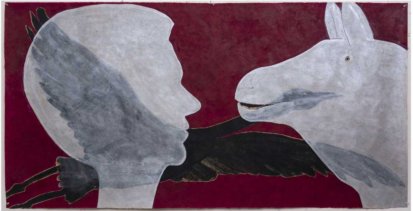
Intimate Dialogues #6, 2022 Acrylic on Japanese paper 100 x 200 cm