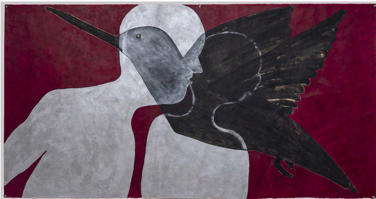
Intimate Dialogues #15, 2022 Acrylic on Japanese paper 100 x 200 cm