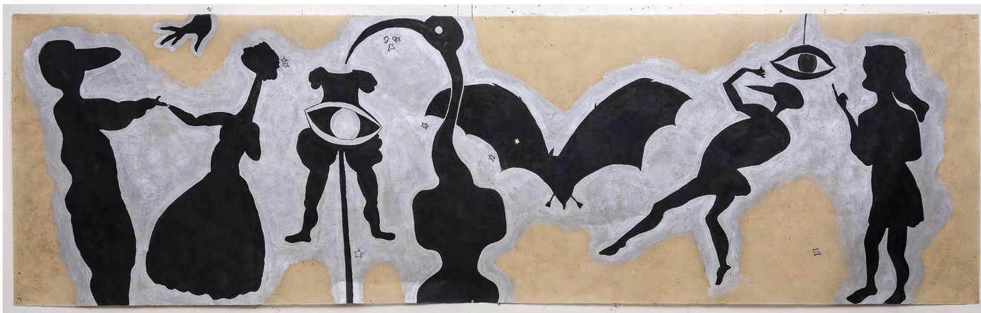
Intimate Dialogues #3, 2022 Acrylic on Japanese paper 100 x 330 cm