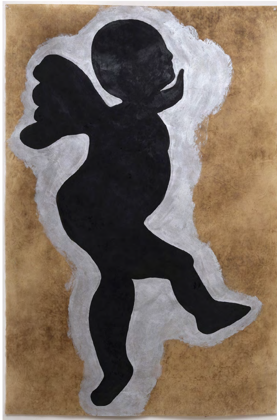
Intimate Dialogues #12, 2022 Acrylic on Japanese paper 150 x 100 cm