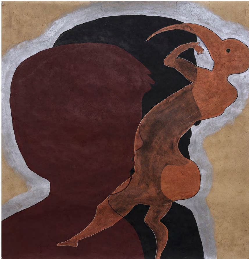
Intimate Dialogues #19, 2022 Acrylic on Japanese paper 100 x 100 cm