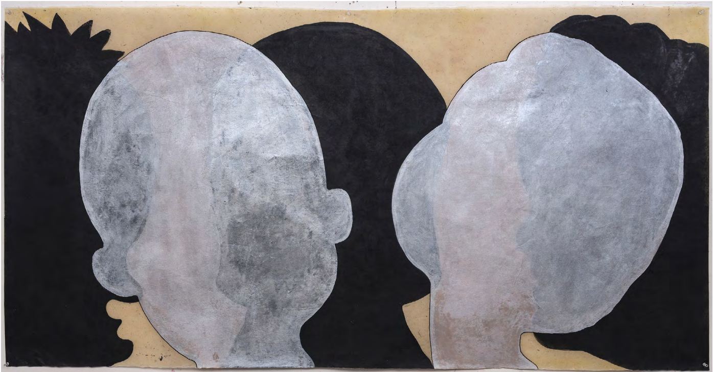
Intimate Dialogues #5, 2022 Acrylic on Japanese paper 100 x 200 cm