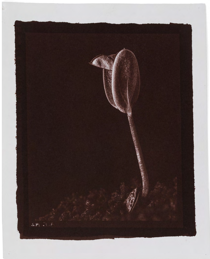
Amorpha fruticosa 2021

From the series Entangled Salt print, print size 20 x 25 cm, framed 36.5 x 42 cm. Edition of 6 multiples: 1/6 (+ 2 AP)