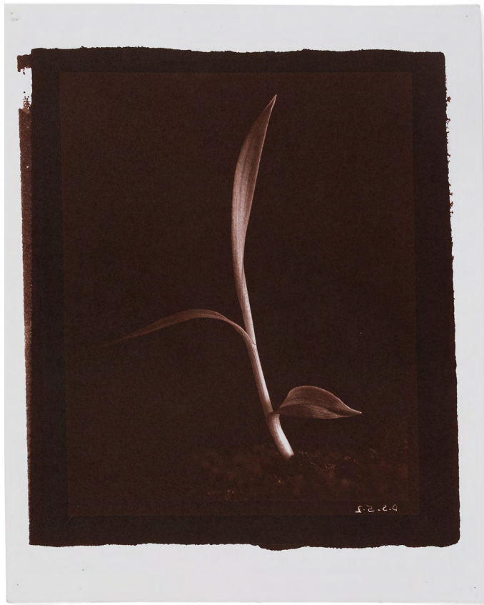
Dichanthium sericeum 2021

From the series Entangled Salt print, print size 20 x 25 cm, framed 36.5 x 42 cm. Edition of 6 multiples: 2/6 (+ 2 AP)