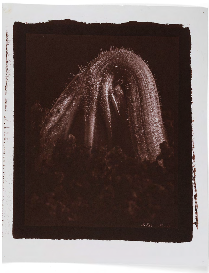
Cucurbita pepo 2021

From the series Entangled Salt print, print size 20 x 25 cm, framed 36.5 x 42 cm. Edition of 6 multiples: 1/6 (+ 2 AP)