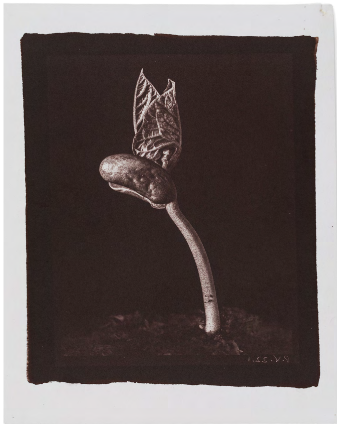
Phaseolus vulgaris (2) 2021

From the series Entangled Salt print, print size 20 x 25 cm, framed 36.5 x 42 cm. Edition of 6 multiples: 1/6 (+ 2 AP)