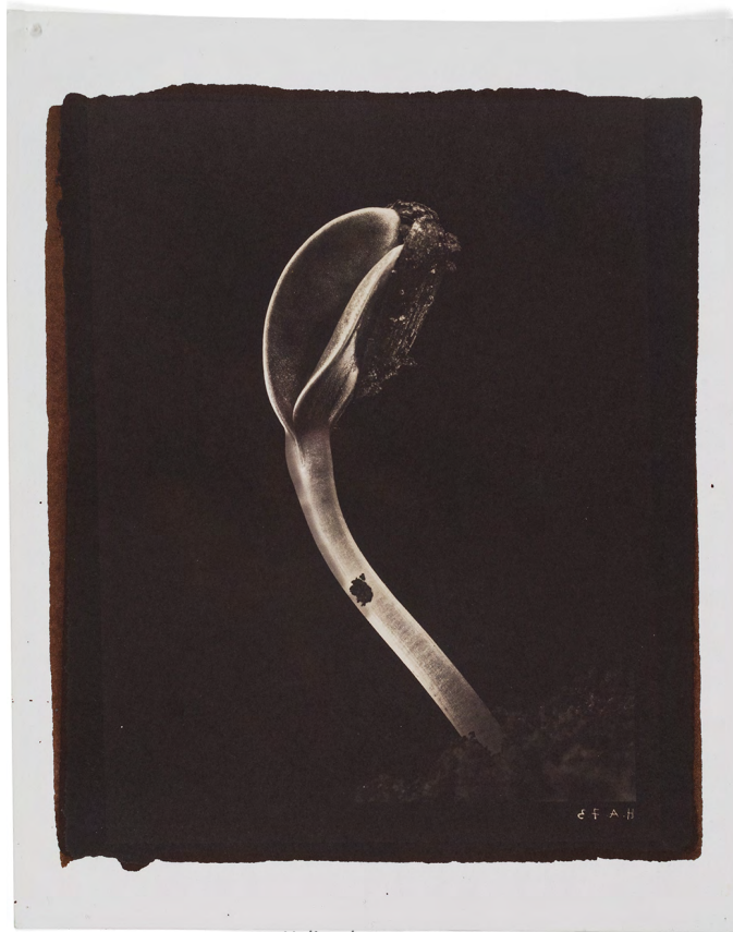
Helianthus annuus 2020

From the series Entangled Salt print, print size 20 x 25 cm, framed 36.5 x 42 cm. Edition of 6 multiples: 1/6 (+ 2 AP)