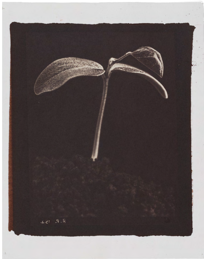
Robinia pseudoacacia 2020

From the series Entangled Salt print, print size 20 x 25 cm, framed 36.5 x 42 cm. Edition of 6 multiples: 1/6 (+ 2 AP)