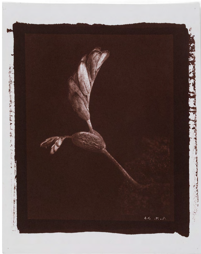
Acacia melanoxylon 2021

From the series Entangled Salt print, print size 20 x 25 cm, framed 36.5 x 42 cm. Edition of 6 multiples: 2/6 (+ 2 AP)