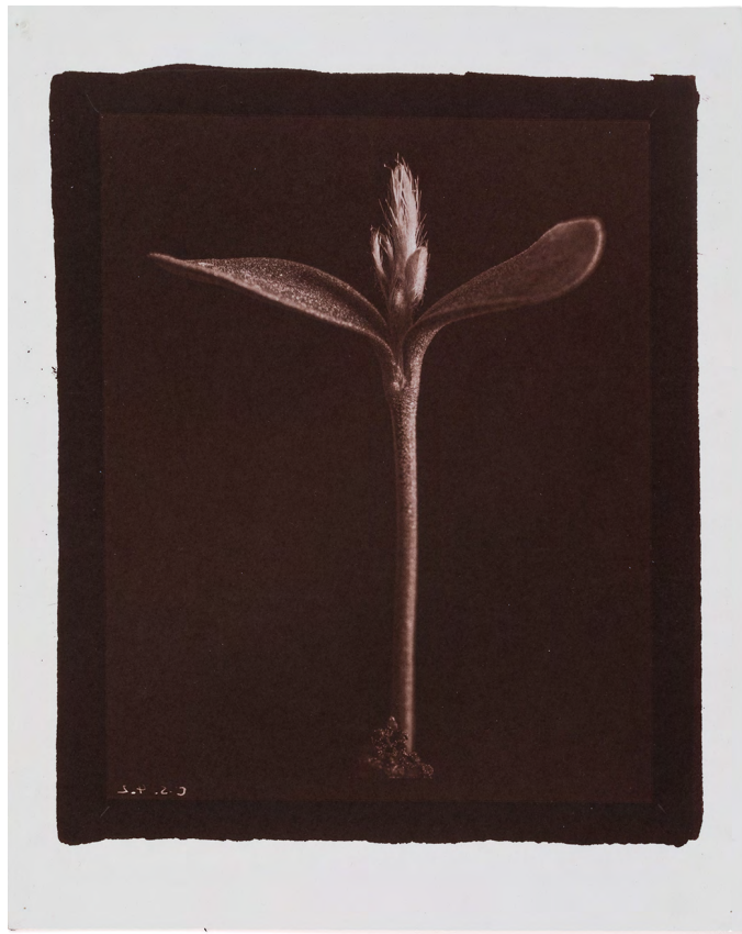
Cytisus scoparius 2020

From the series Entangled Salt print, print size 20 x 25 cm, framed 36.5 x 42 cm. Edition of 6 multiples: 1/6 (+ 2 AP)