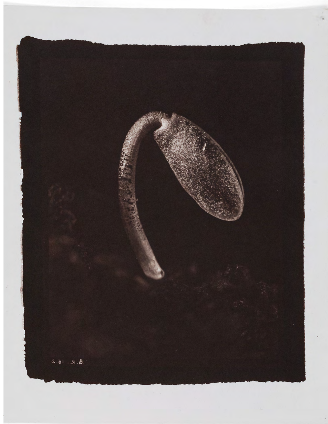
Allocauarina rigida 2020

From the series Entangled Salt print, print size 20 x 25 cm, framed 36.5 x 42 cm. Edition of 6 multiples: 1/6 (+ 2 AP)