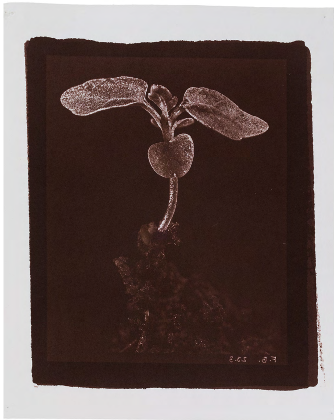
Ficus benghalensis 2021

From the series Entangled Salt print, print size 20 x 25 cm, framed 36.5 x 42 cm. Edition of 6 multiples: 1/6 (+ 2 AP)