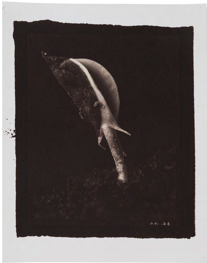
Banksia robur 2020

From the series Entangled Salt print, print size 20 x 25 cm, framed 36.5 x 42 cm. Edition of 6 multiples: 1/6 (+ 2 AP)