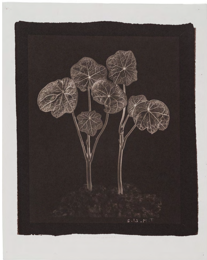
Tropaeolum minus 2020

From the series Entangled Salt print, print size 20 x 25 cm, framed 36.5 x 42 cm. Edition of 6 multiples: 1/6 (+ 2 AP)