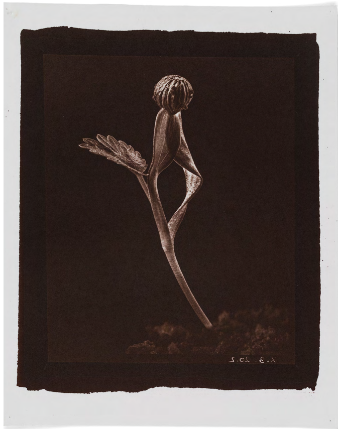
Coriandrum sativum 2021

From the series Entangled Salt print, print size 20 x 25 cm, framed 36.5 x 42 cm. Edition of 6 multiples: 2/6 (+ 2 AP)