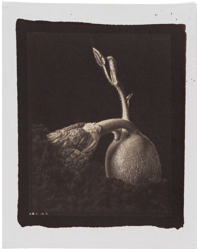
Brachychiton bidwillii 2021

From the series Entangled Salt print, print size 20 x 25 cm, framed 36.5 x 42 cm. Edition of 6 multiples: 2/6 (+ 2 AP)