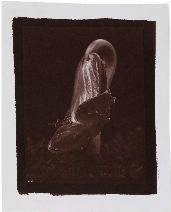
Gleditsia triacanthos 2021

From the series Entangled Salt print, print size 20 x 25 cm, framed 36.5 x 42 cm. Edition of 6 multiples: 1/6 (+ 2 AP)