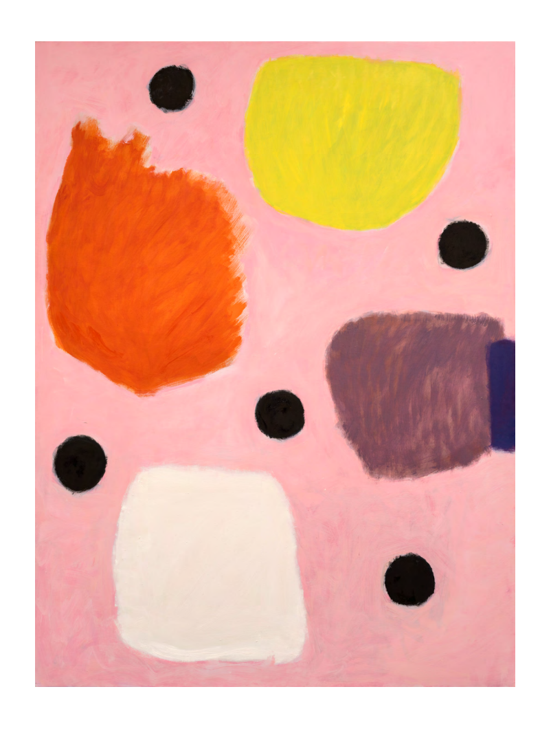
Sets of sets (one), 2023 Oil on linen 183 x 137.5cm