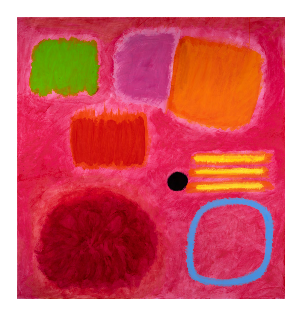
Reasons and Passions, 2023 Oil on linen 180.5 x 170.5cm