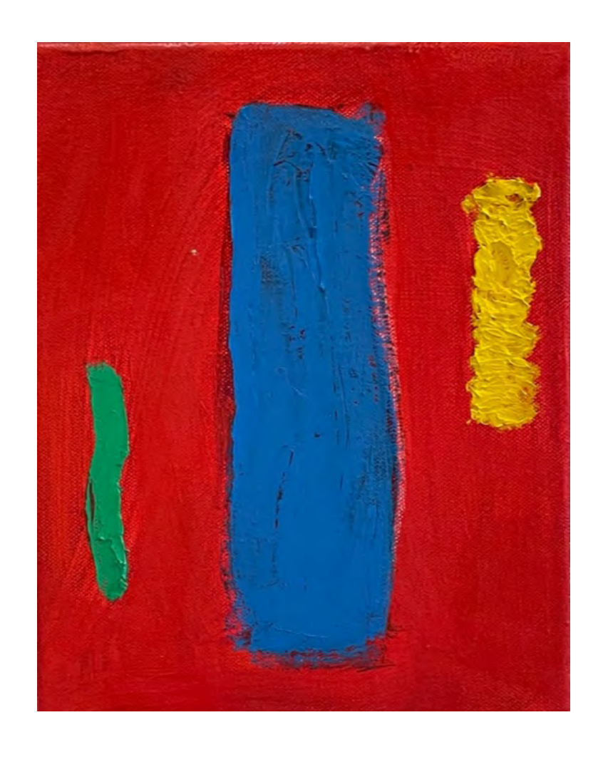
Obsession (1), 2023 Oil on linen 25.5 x 20.5cm