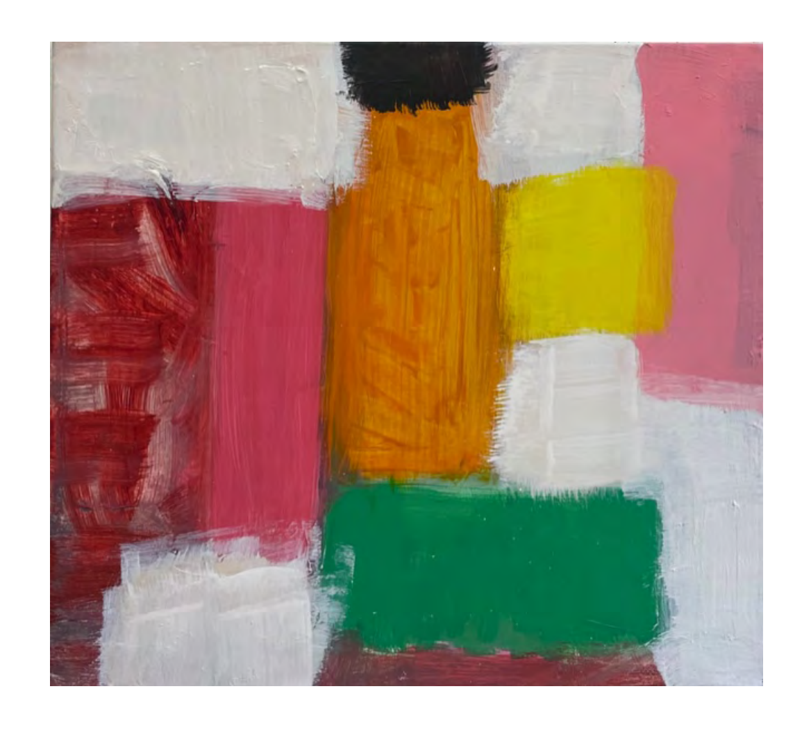
Wait there yellow square, 2023 Oil on linen 50.5 x 60.5cm