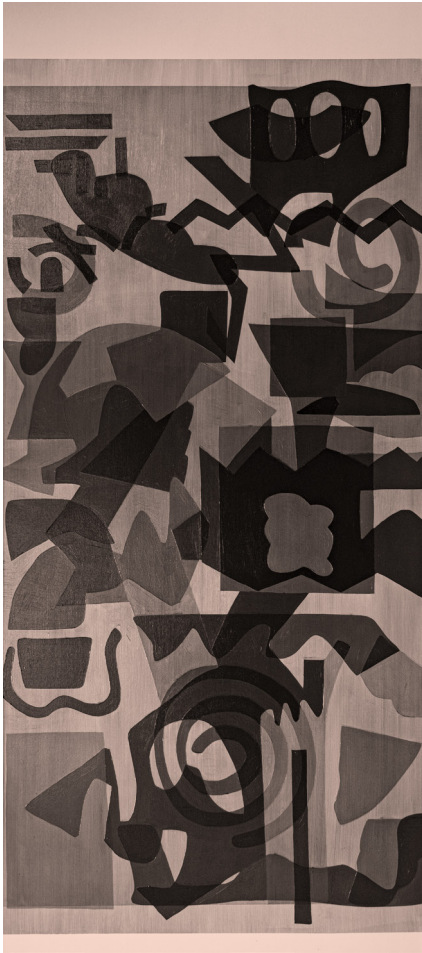
Whirling Hop and Skip After SJ , 2022 Oil on canvas 244 x 107cm