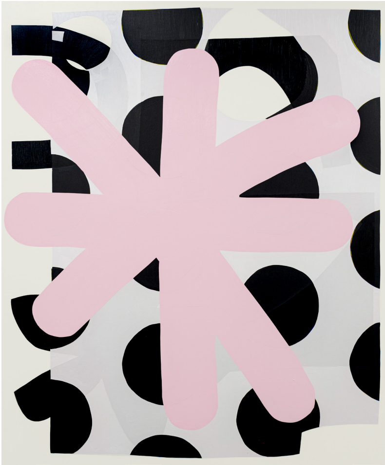
Asterisk , 2022 Oil on canvas 183 x 152cm