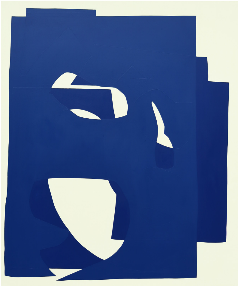
Simultaneous Disguise 288 , 2022 Oil on canvas 183 x 152cm