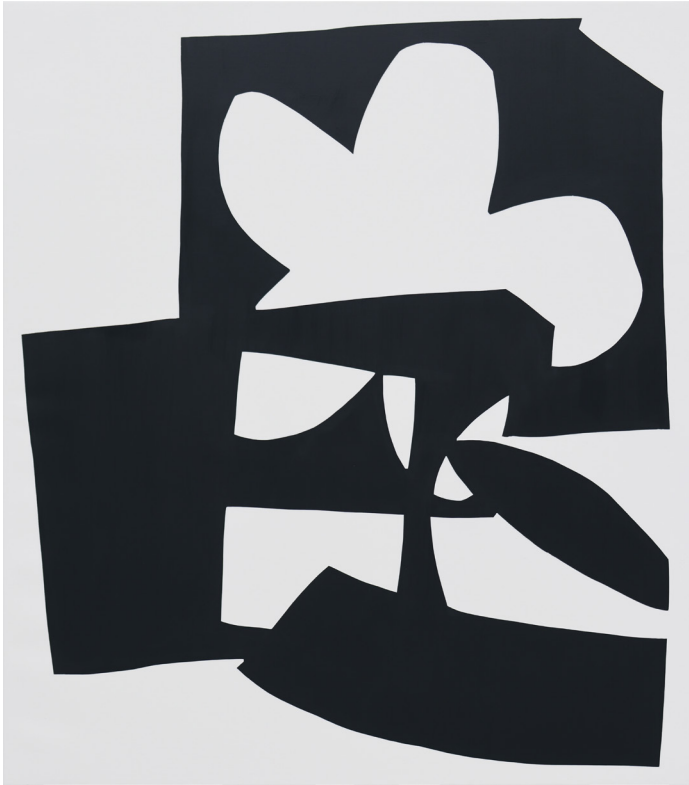
Open Relief , 2022 Oil on canvas 122 x 107cm