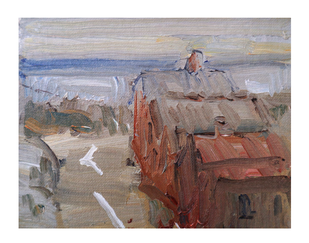
The Coastal Route, 2023 Oil on canvas, framed in Tasmanian oak 15 x 19 cm