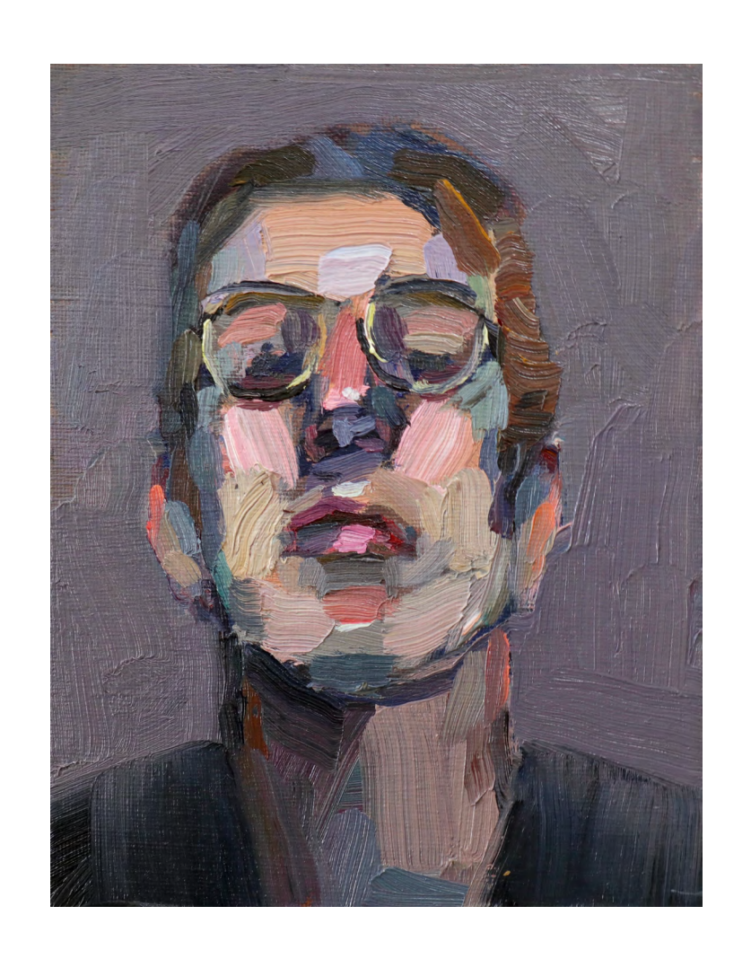
\begin{tabular}{ll} \it Jet lagged, 2023 \\ \it Oil on canvas, framed in Tasmanian oak \\ \it 19 x 15 cm \\ \end{tabular}