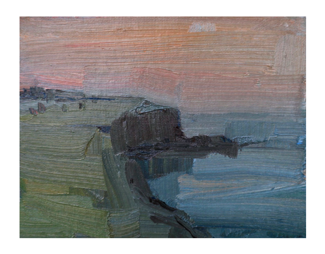
This Is What I Remember, 2023 Oil on canvas, framed in Tasmanian oak 15 x 19 cm