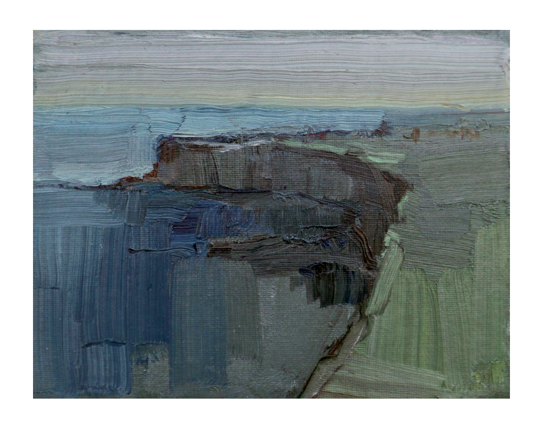
It's A Long Way Down, 2023 Oil on canvas, framed in Tasmanian oak 15 x 19 cm