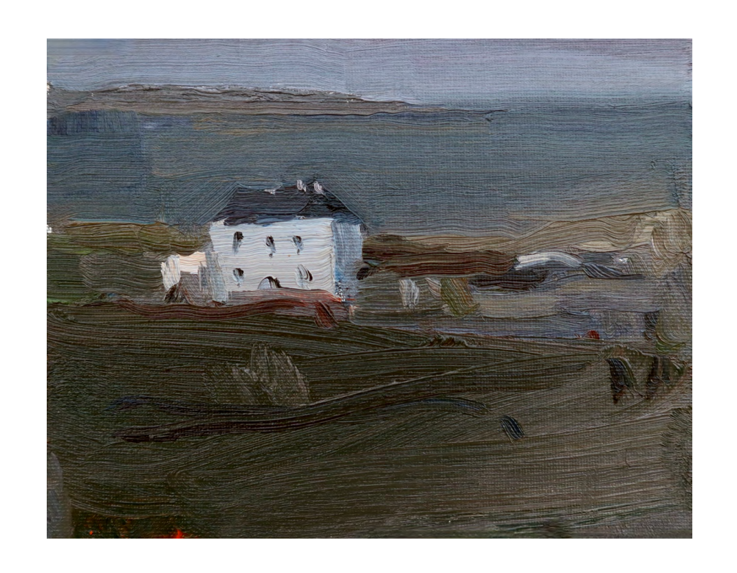
Exposed To The Elements, 2023 Oil on canvas, framed in Tasmanian oak 15 x 19 cm