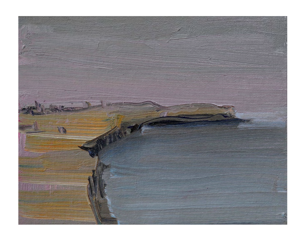
\begin{tabular}{ll} \textit{Lingering Light, 2023}\\ \textit{Oil on canvas, framed in Tasmanian oak}\\ \textit{15} \times \textit{19} \ \textit{cm} \end{tabular}