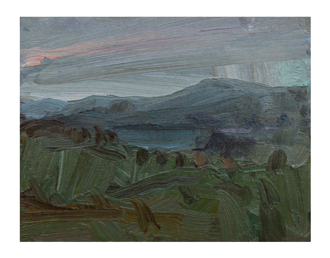
The Passage Through, 2023 Oil on canvas, framed in Tasmanian oak 15 x 19 cm