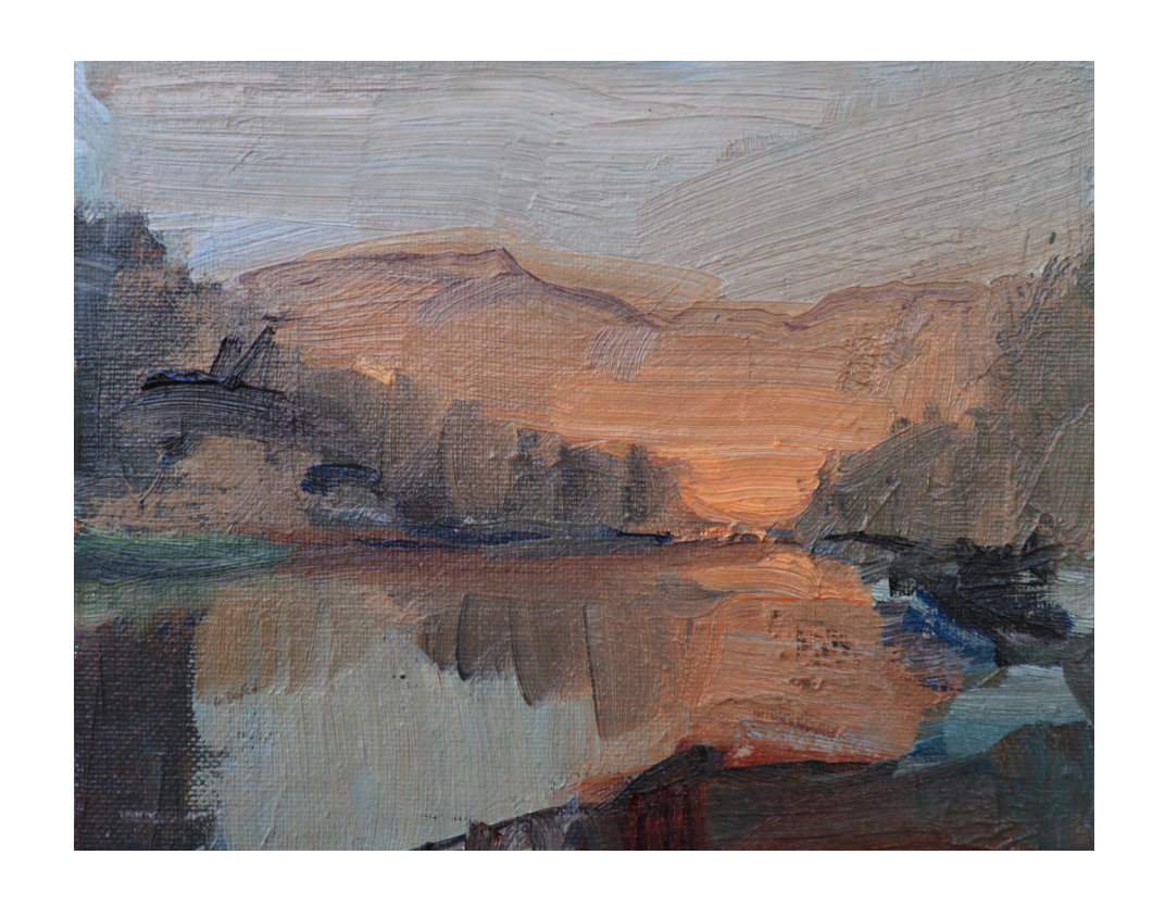
That Warm Inner Glow, 2023 Oil on canvas, framed in Tasmanian oak 15 x 19 cm