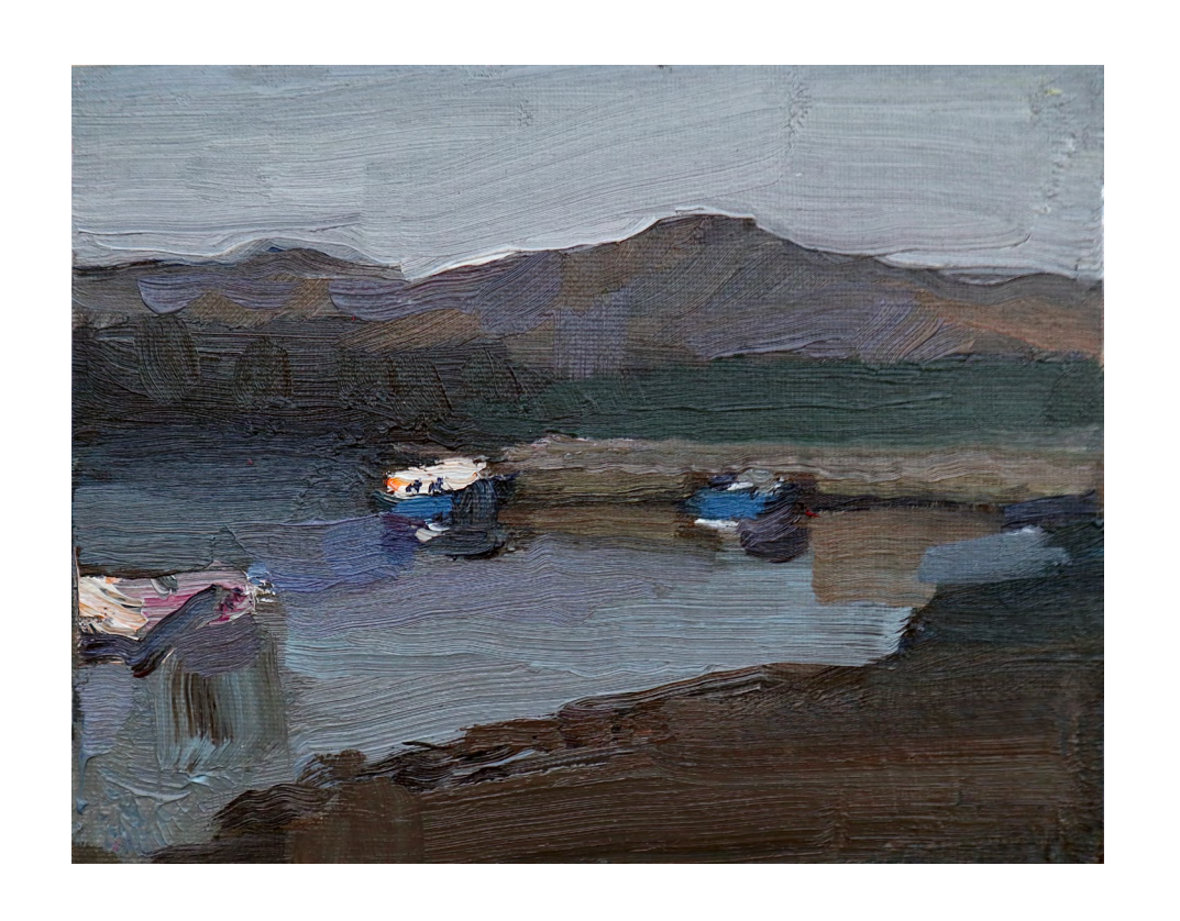
No Fixed Address, 2023 Oil on canvas, framed in Tasmanian oak 15 x 19 cm