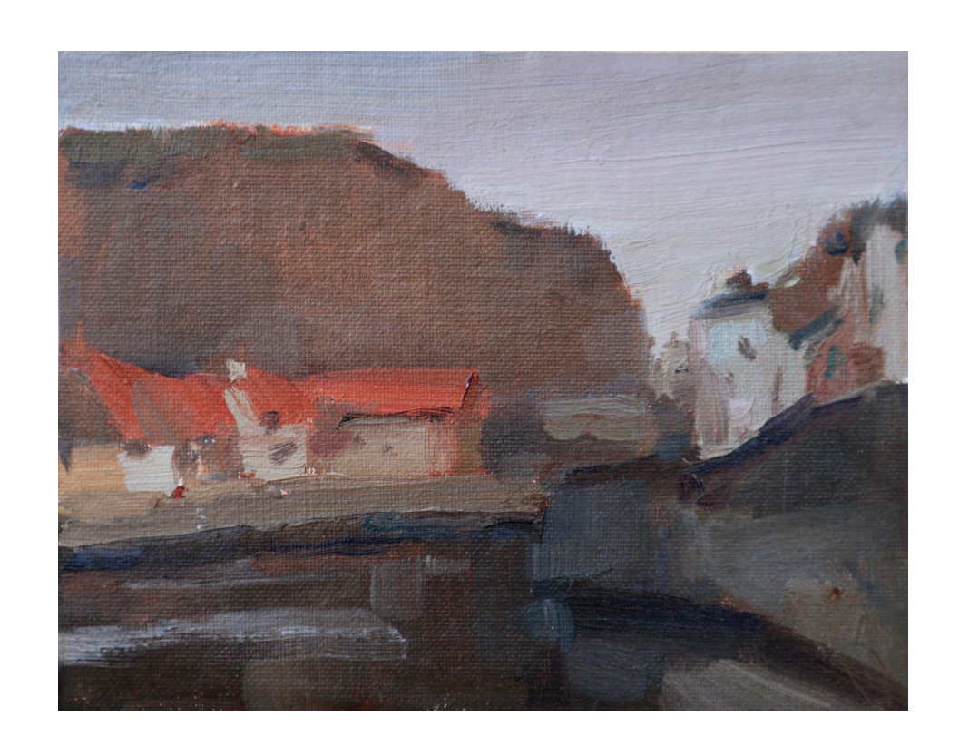
If Only We Had More Time Together, 2023 Oil on canvas, framed in Tasmanian oak 15 x 19 cm